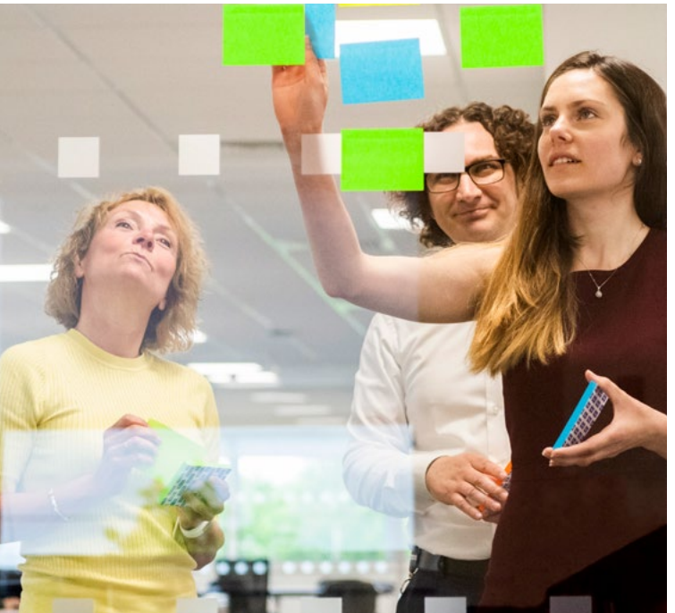
Voure part of it